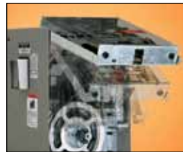
unique design allow easy access to all mechanical parts