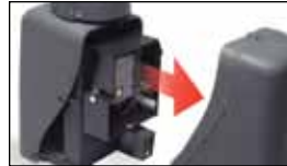
easy access case design