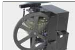
steel frame belt driven