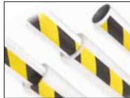
barrier arms available in aluminum/wood or plastic with optional foam padding