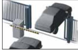
automatic p.a.m.s. sequencing with slide and swing gates