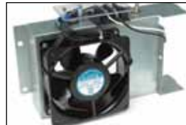
fan/heater kits options available for extreme weather conditions