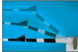
folding arm kits available for low headroom applications